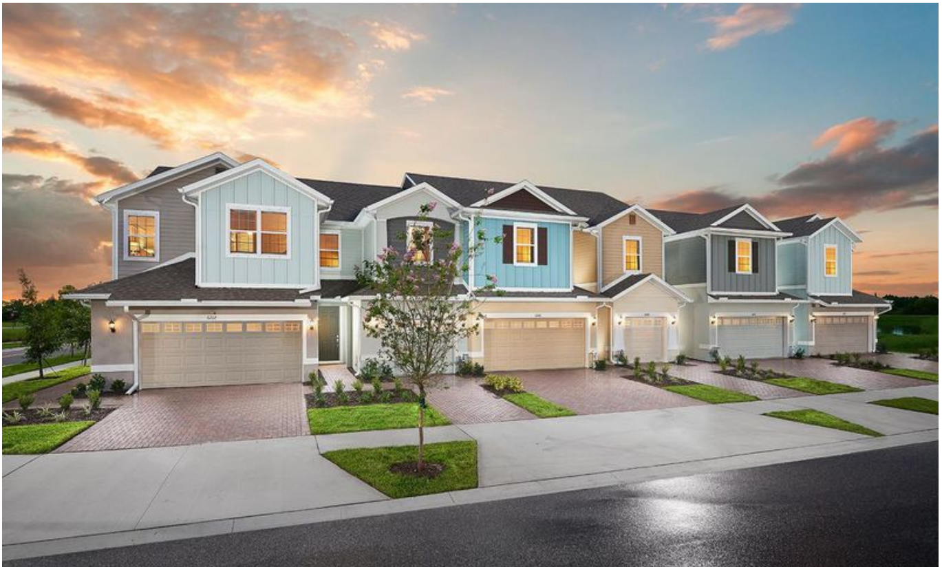
Park Square Homes will offer the same front-loaded townhouse product it's building in the East Narcoossee area at the new Winter Haven site.